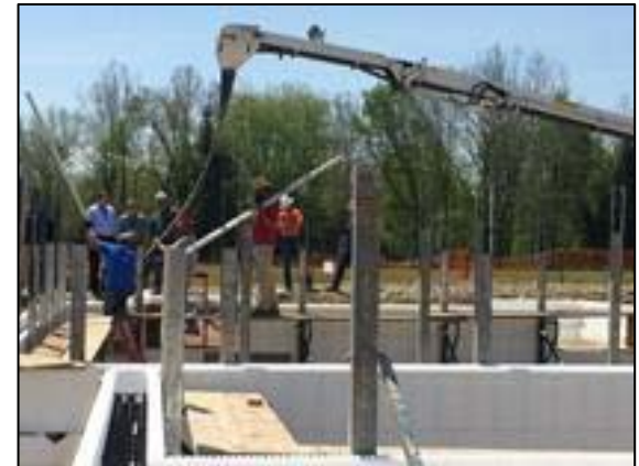
Pouring Concrete Walls