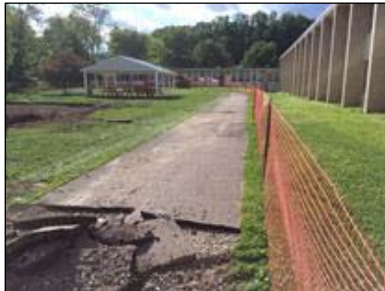
Removing Existing Walkways