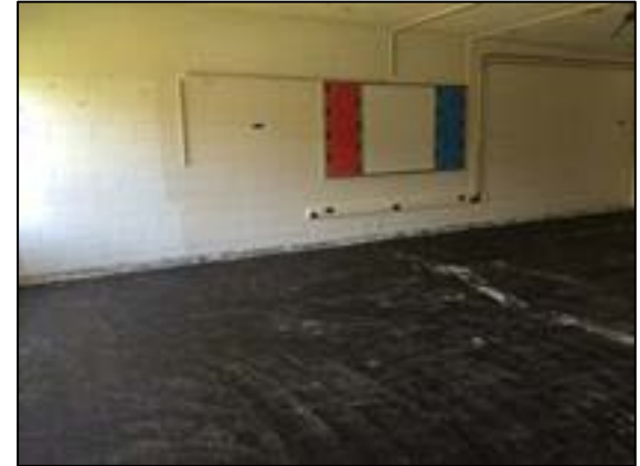
Floor Tiles Removed