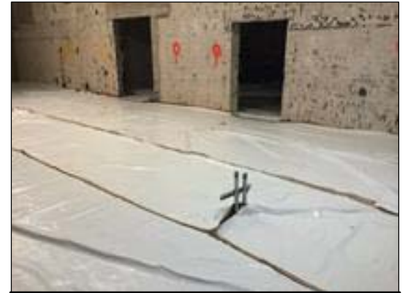
Floor Covered with Coated Burlap for Curing