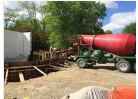
Pouring Loading Dock Concrete