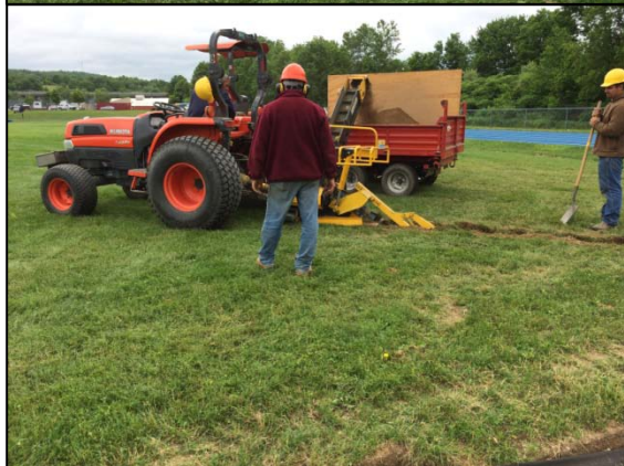
Trenching Field for Slit Drains