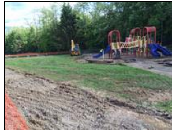
Removing Existing Walkways