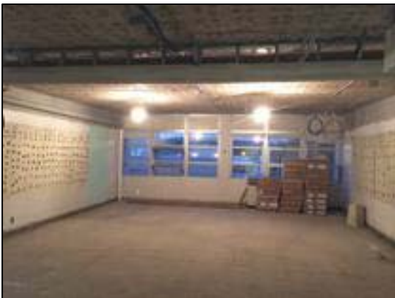
Ceiling Bulkhead Construction