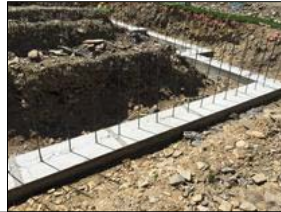
Field House Footer Preparation