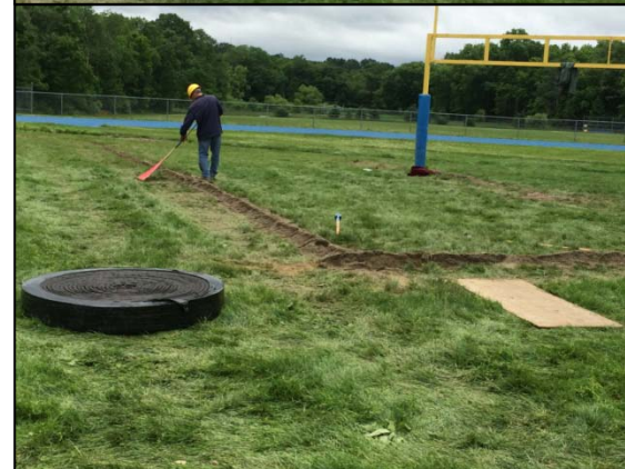
Backfilling and Grooming Sand