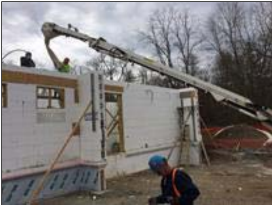
Insulated Concrete Walls