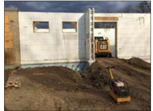
Backfilling at Addition