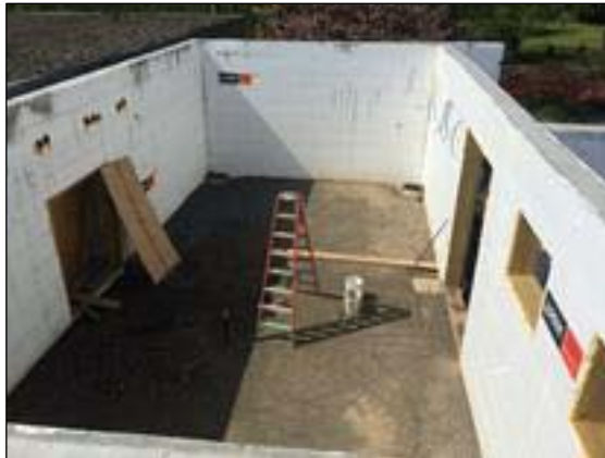
Formed and Poured Walls Complete