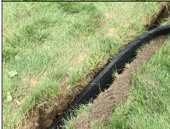
Slit Drains in Place