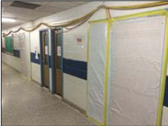
Classroom Abatement – Code-Compliant Barriers and Negative Air in Place