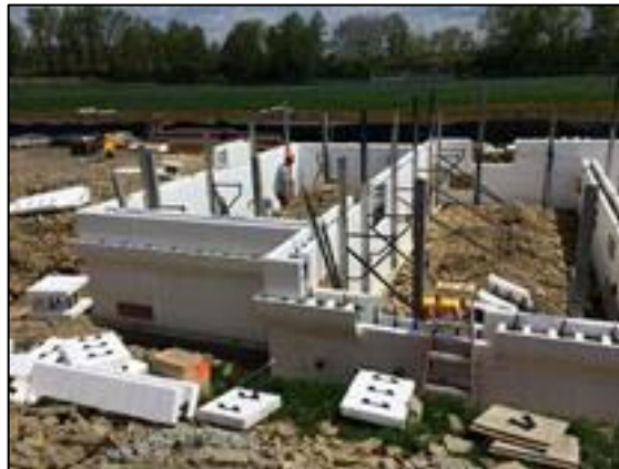
Insulated Concrete Forms being Erected