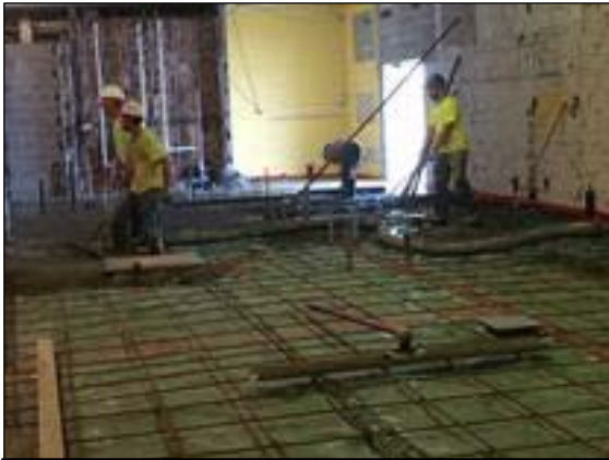
Pouring Concrete Floor in Kitchen