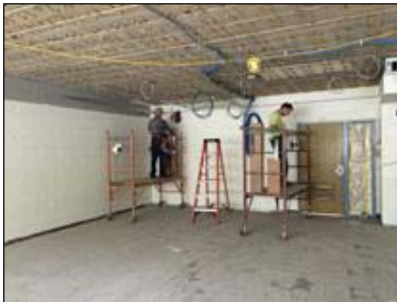
Installing Wiring for Ceiling Lights