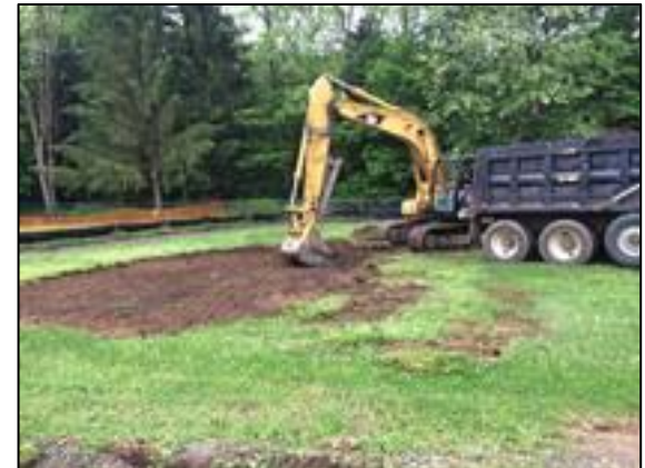
Playground Swings Removed